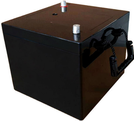
GS-12-130X Combat tank and Armoured Vehicle Battery